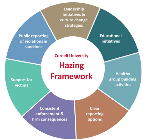
Cornell’s comprehensive public health approach to hazing

and well-being of students (undergraduate, graduate, and professional) as a foundation for academic and life success.”